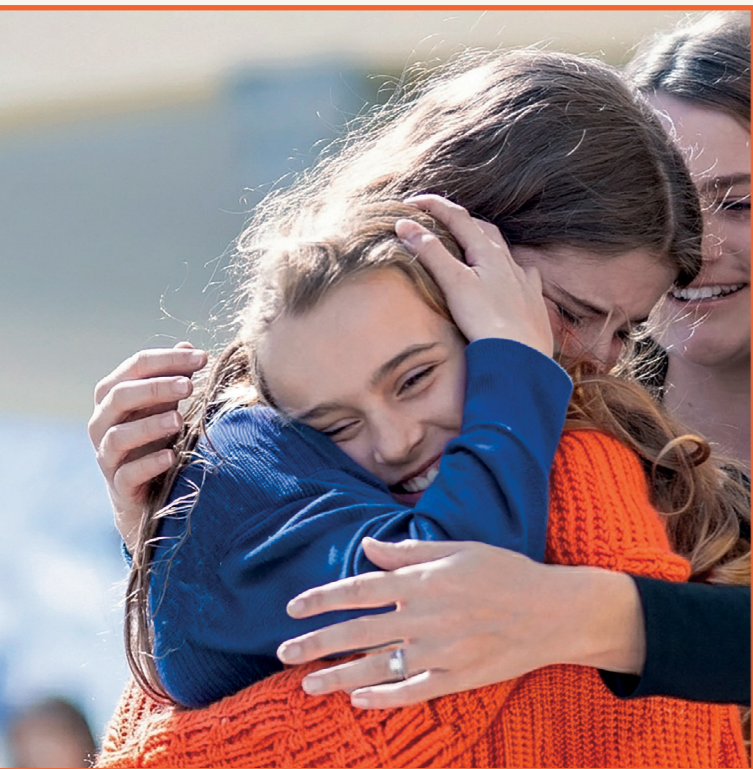
Ignite Parent, 2025

“As a parent, I would not hesitate to recommend the Ignite programme. Giving our kids the opportunity to build resilience, learn that they can do hard things, clean up after themselves, be responsible for themselves, be more organised and accountable, all within such a safe, controlled, nurturing environment, is a truly unique opportunity for this age group. And all of this personal growth comes in addition to the phenomenal outdoor programme.”